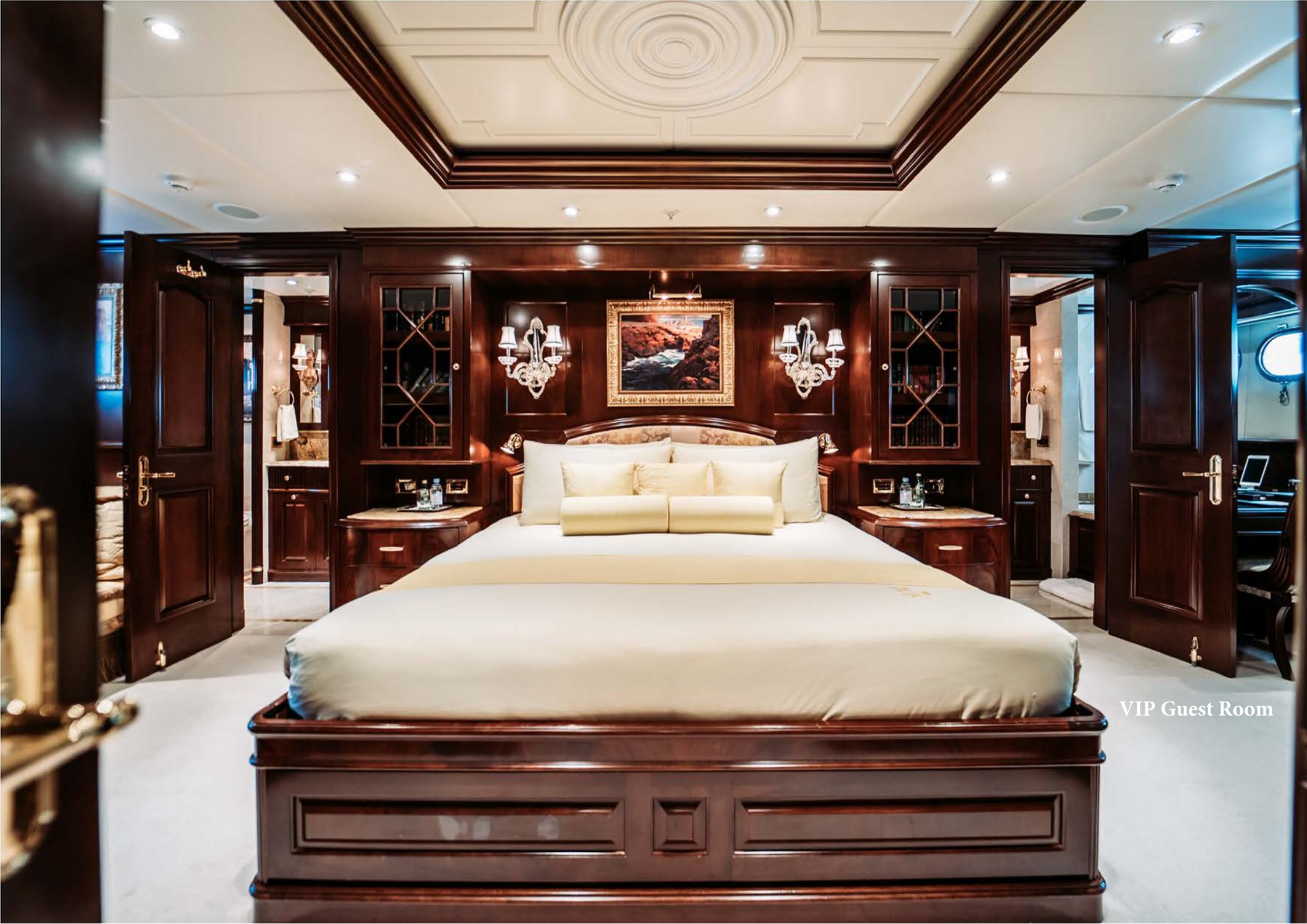
VIP Guest Room